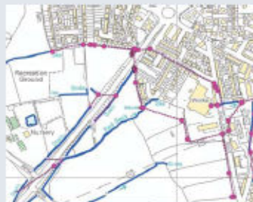
Map of culverts in Leeds